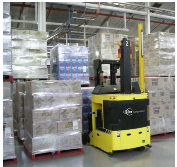
SGV Block Stacking Pallets in Buffer Storage Lanes