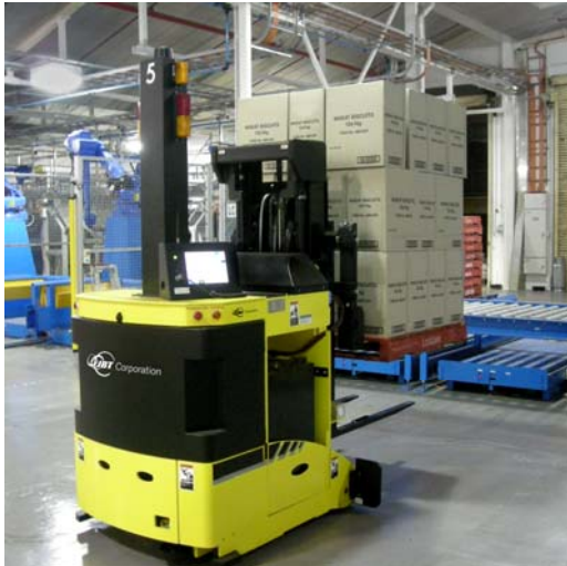
A full pallet is transported to the stretch wrapper